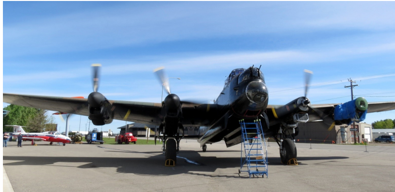
What a wonderful sight (and sound) - three Merlin engines.

In case you weren't there, our friends and partners at the Bomber Command Museum of Canada marked a major milestone during Nanton Celebrates History day on June 1. The third Merlin engine on their Lancaster chugged to life for the first time since the early 1960s.